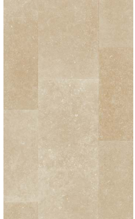
CREAMY LIMESTONE ● pro L0253-05486