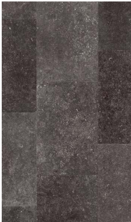
SMOKED BLUESTONE ● pro L0253-05484