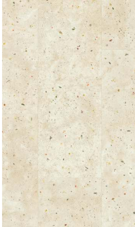
FLORAL CONCRETE ● pro L0253-05494