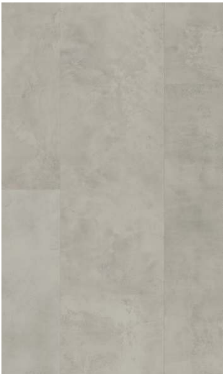
SOFT GREY CONCRETE ● pro L0253-05488